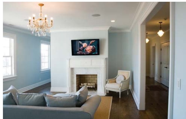
Sitting Room featuring Pioneer 42" plasma display, lighting control and in-ceiling speakers.