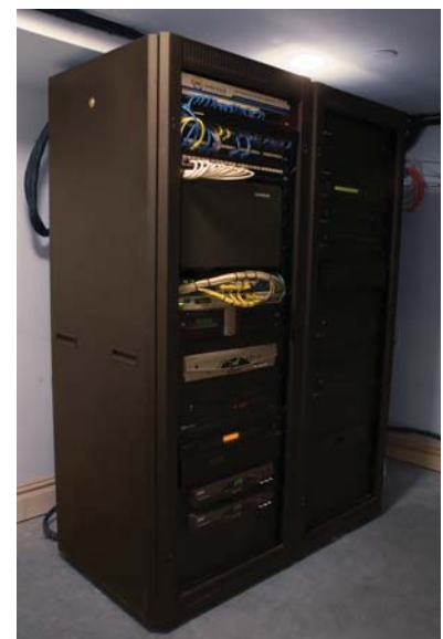
The main audio visual rack is located in the basement and houses all of the system processors.