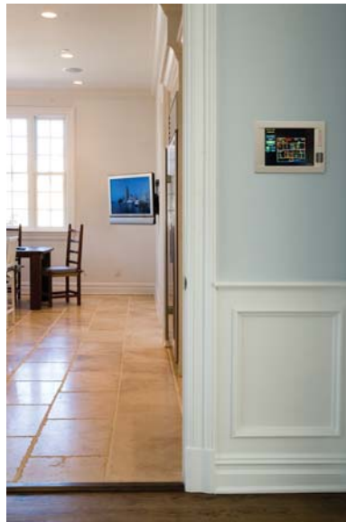
The main panel allows access to view and control all home systems including lighting, security, music and climate.