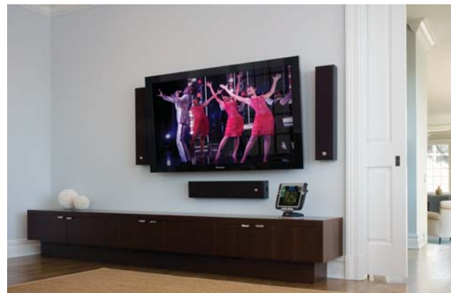
Wall-mounted 60" Pioneer plasma display with Crestron wireless touchscreen remote sits above custom Wenge wood credenza.