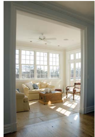
The Sun Room has in-ceiling speakers, Crestron-controlled lighting and climate sensors.