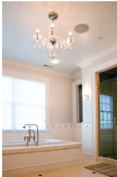
The Master Bath features lighting control, in-ceiling speakers and radiant heat control.