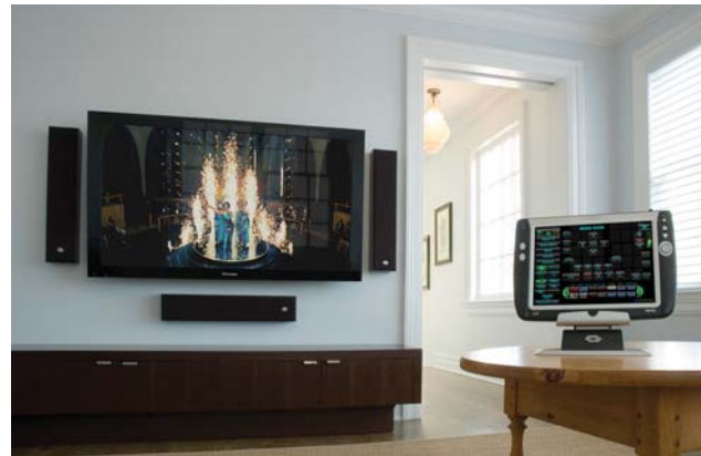
Home Theater, Private Residence, Westchester, NY.

Lighting control was driven through a Crestron system. This enables the homeowner to remotely monitor the lights and allows ease of use when at home. 'All off', 'all on', 'dimnable', or 'scenes' for special occasions—all at the touch of a button. While the client is traveling, the lighting system uses 'vacation mode', which replays the past two weeks of lighting activity as stored in memory.