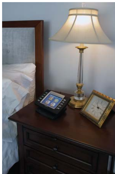
Crestron remotes control floor temperature and all audio/video.