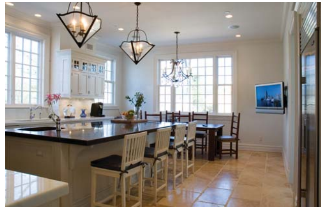
The Kitchen features a 37" LCD that is integrated with the whole house audio/video system.